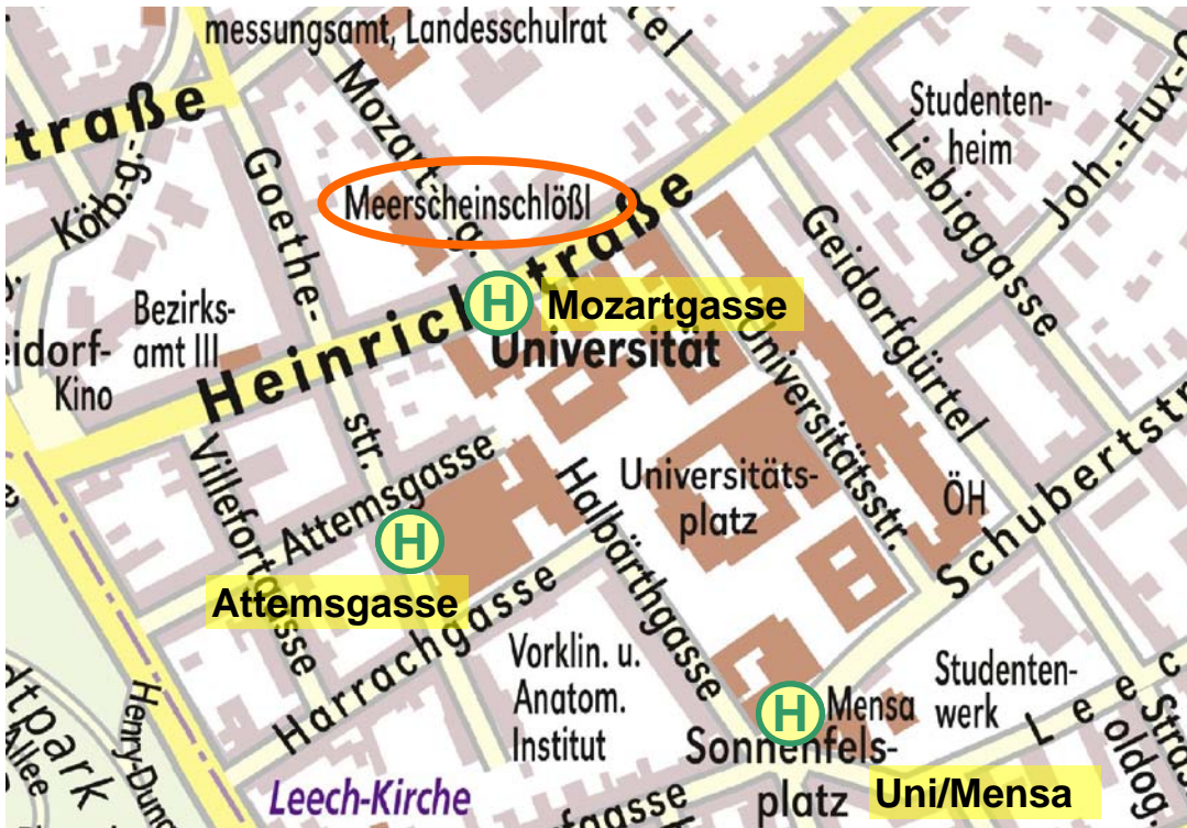
Bus stops around the university