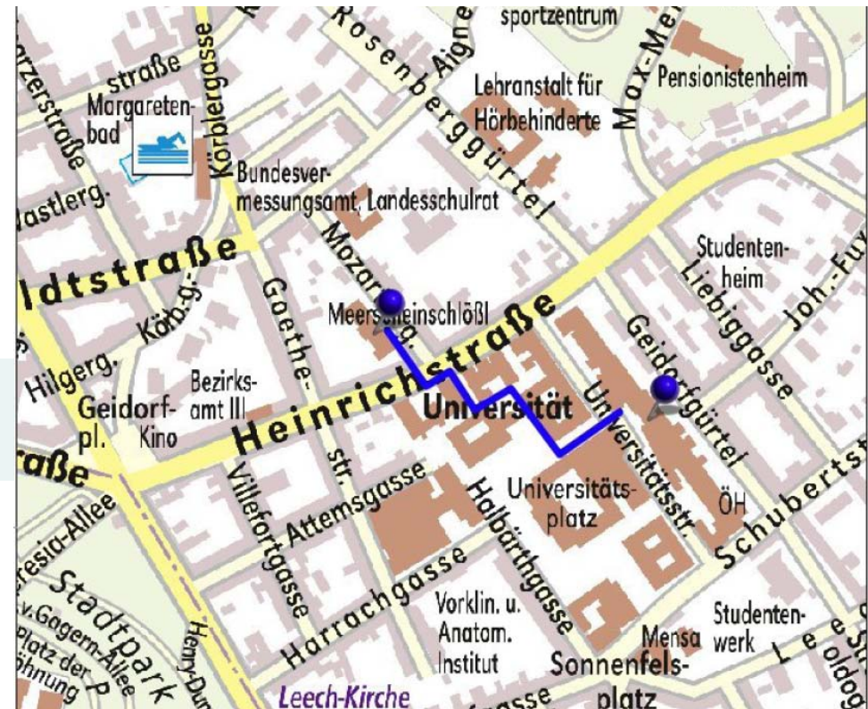
From Workshop venue to Working Group meetings (From Meerscheinschlößl to RESOWI-Zentrum)