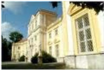
Meerscheinschlößl Mozartgasse 3